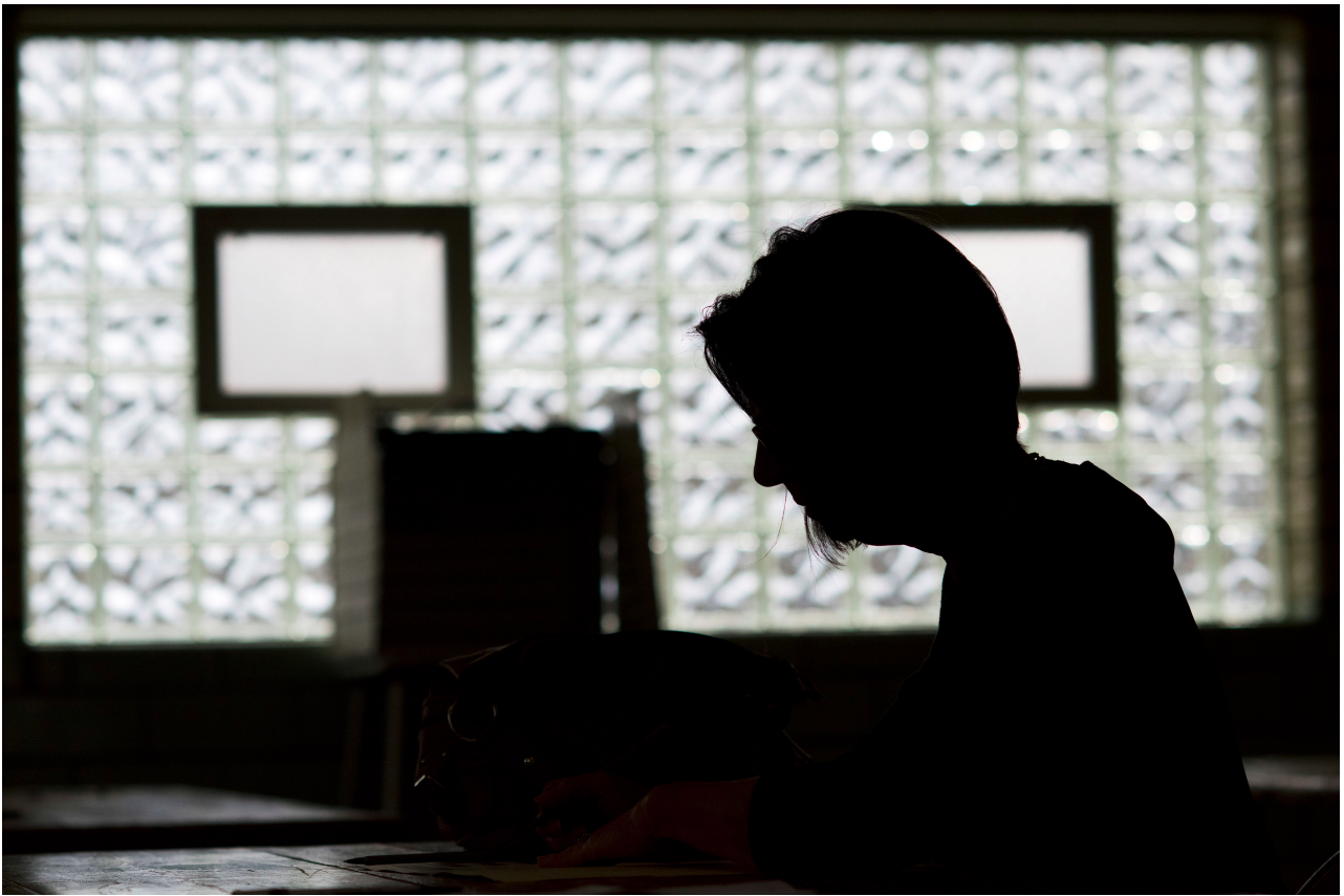
A voter casts her ballot on Nov. 8, 2016 in Ohio.