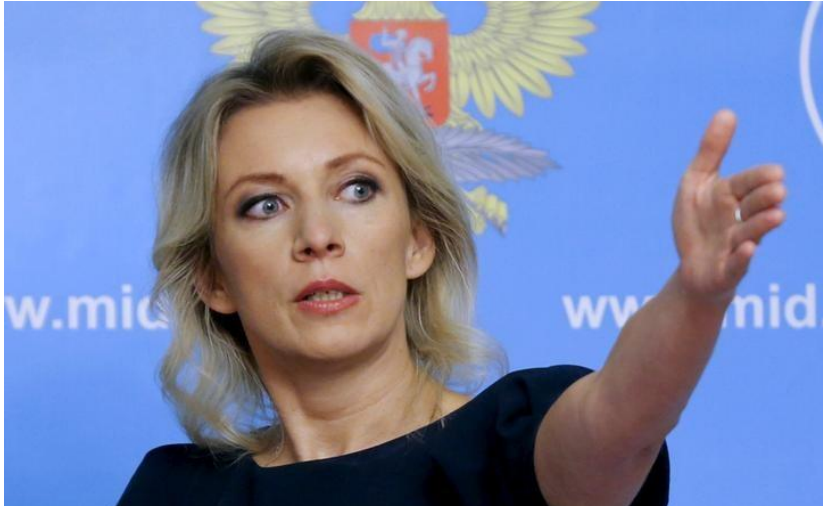
Spokeswoman of the Russian Foreign Ministry Maria Zakharova gestures as she attends a news briefing in Moscow, Russia, October 6, 2015.